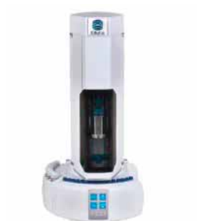
EL3100A liquid autosampler