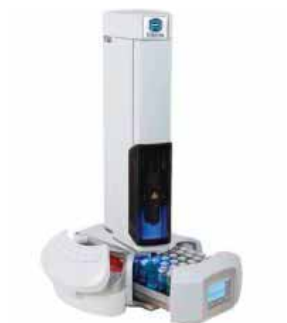
EL2000H Headspace sampler