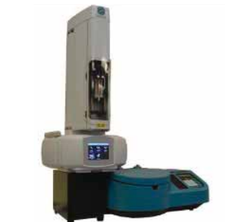
EL3000A liquid autosampler