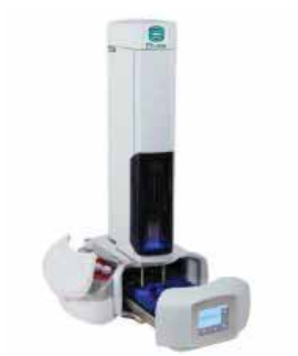
EL2800T all in one